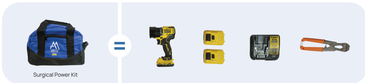
Surgical Power Kit

Includes: 1 K-wire Pin 2mm x 310mm (same as 2mm x 12.2 inch), 1 Set of pin tip covers, 1 SteriGo Single-use Cover, 4 Blue Towels, 4 Sticky drapes, 1 Roll of Kerlix, 1 20cc Syringe, 2 18ga x 1.5 Needle, 2 22ga x 1.5 Needle, 1 11 Blade, 1 Skin marking pen, 2 4"x4" Gauze pads, 2 Xeroform pads, 1 Traction rope, 2 10.5ml of Chloraprep w/ Applicator